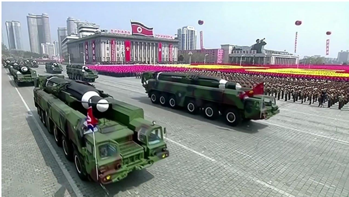
Sometimes, a military parade is being held on the 15 th of April, the 'Day of the Sun'. Picture is from 2017.

Are you interested in learning about these political and economic developments, and in having discussions with North Koreans? Then you are welcome to join our press tour in April 2018. We try to make program interesting and well-varied, and it will include various visits (e.g. to factories, a school, a farm, museums, a university) in Pyongyang, while attending some cultural events as well. We will also travel south to Kaesong and the DMZ (DeMilitarized Zone) at Panmunjom. During the tour, there will be options for formal and informal discussions with Koreans.