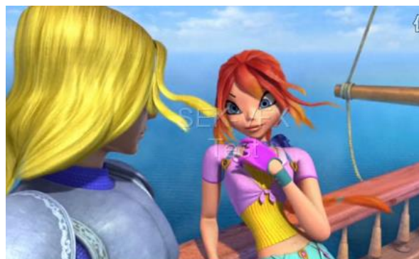
examples of animation made in North Korea

Especially Chinese companies have been outsourcing ICT and BPO-work to neighboring North Korea. It has also been a 'nearshore' destination for clients from Japan and South Korea as well. For example, Samsung from South Korea has been using software made in the North in its range of mobile phones. For other clients, North Korean ICT companies have been working on central elements of NGN (next generation) networks, and integrated network management systems. They are also experienced with IP PBX, IP Videophone, Digital Media Gateway, IP TV and 4G Core Network components. R&D cooperation can be requested to embrace design optimization, authentication and route control of data communication networks based on the concepts of Software-Defined Network and Network Function Virtualization.