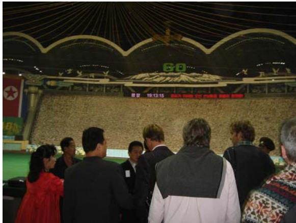
Photo: delegates of a trade mission attending the famous Arirang Massgame