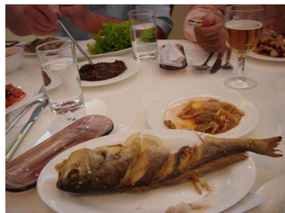
Photo: at a local restaurant - an excellent place for informal business discussions