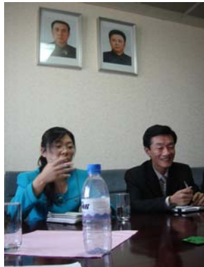
Photo: a friendly and informative business meeting

In the mornings, business meetings with representatives of North-Korean companies will commence in the hotel. These meetings will be arranged, on request by the participants, by the DPRK Chamber of Commerce. In the afternoons, the delegates can visit firms in and around Pyongyang from a range of sectors, including agriculture, textiles and garments, ceramics, computer software, art, animation and cartoons.