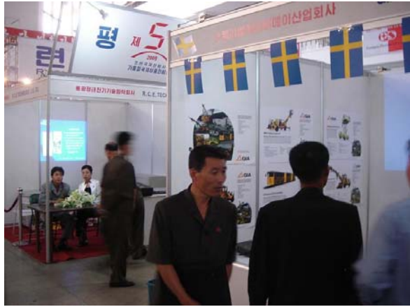
Booth of a company from Sweden