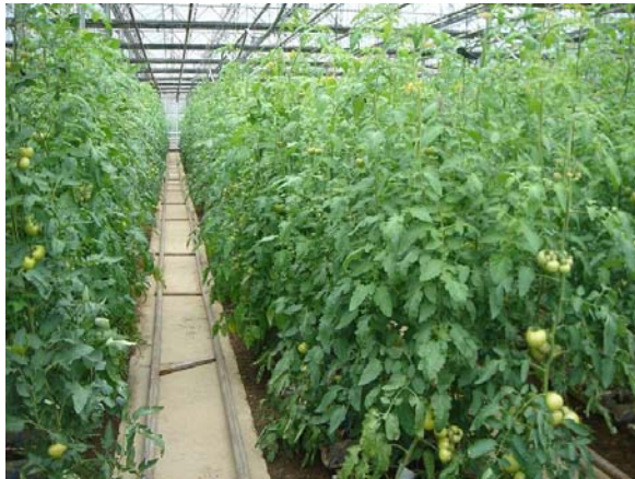
Visit to a greenhouse