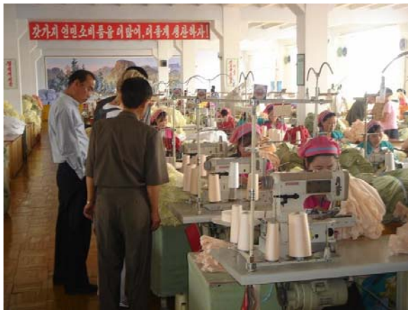
Visits to garments factories