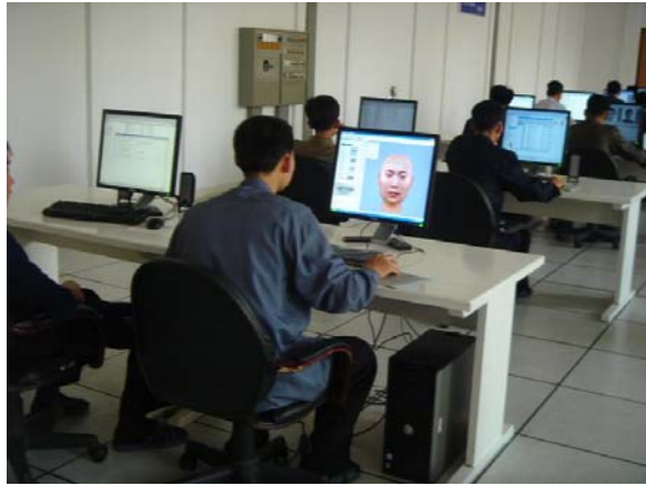
Visit to a software company