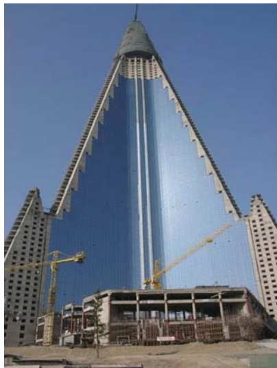
Photo: work on the Ryugyong Hotel

It established several free trade zones to attract foreign investors and there are several sectors, including renewable energy, textile, shipbuilding, agro business, fishing, horticulture, logistics, mining, stone processing, restaurants and Information Technology, that can be considered for trade and investment. DPRK is competing with other Asian countries by offering skilled labour for very low monthly wages. In particular companies with production facilities in China, where the wages are rising fast, are currently investigating alternative options in North-Korea.