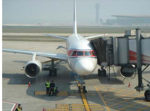
Photo: one of the new planes of Air Koryo

In the morning: visa collection at the DPRK Embassy in Beijing. Receiving Air Koryo airplane tickets. Afternoon: available for individual program. Tentative: the seminar: "Doing business with DPRK" takes place. The event, with several speakers, will address various aspects of doing business in DPRK.