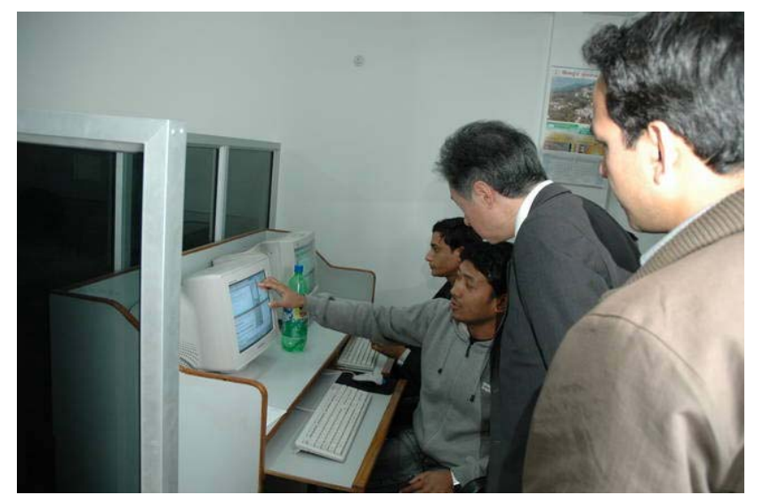
HighTech Valley. Software development.