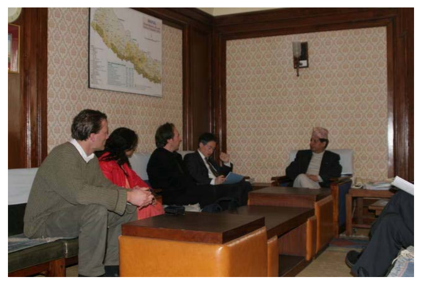
Visit to the Government: National Planning Commission (Vice Chairman)