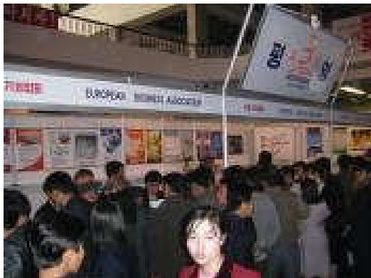
Included: a visit to the Pyongyang International Trade Fair