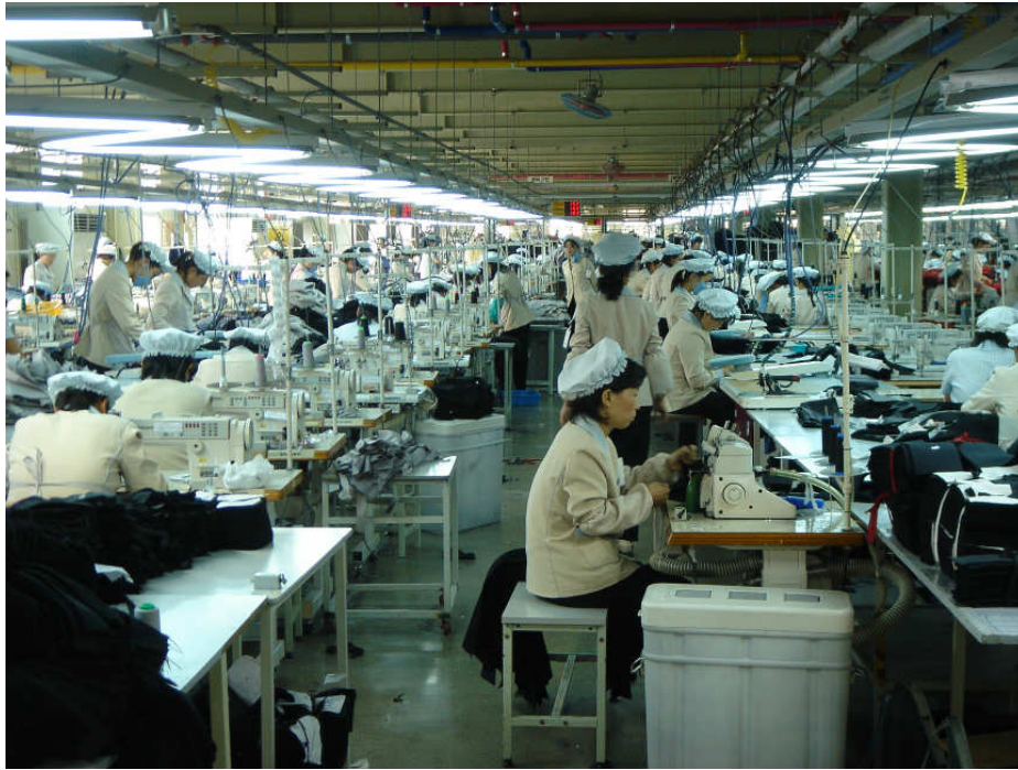
Photo: visits to companies in the field of textiles are possible