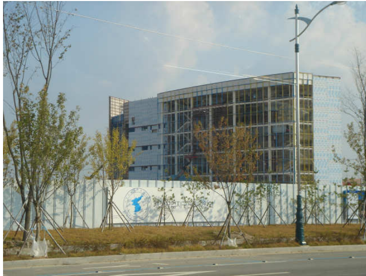
Photo: the rapidly expanding industrial zone at Kaesong (light industry)

GPI Consultancy, P.O. Box 26151, 3002 ED Rotterdam, The Netherlands Tel.: +31-10-4254172, fax: +31-10-4254317 E-mail: info@gpic.nl , web: http://www.gpic.nl