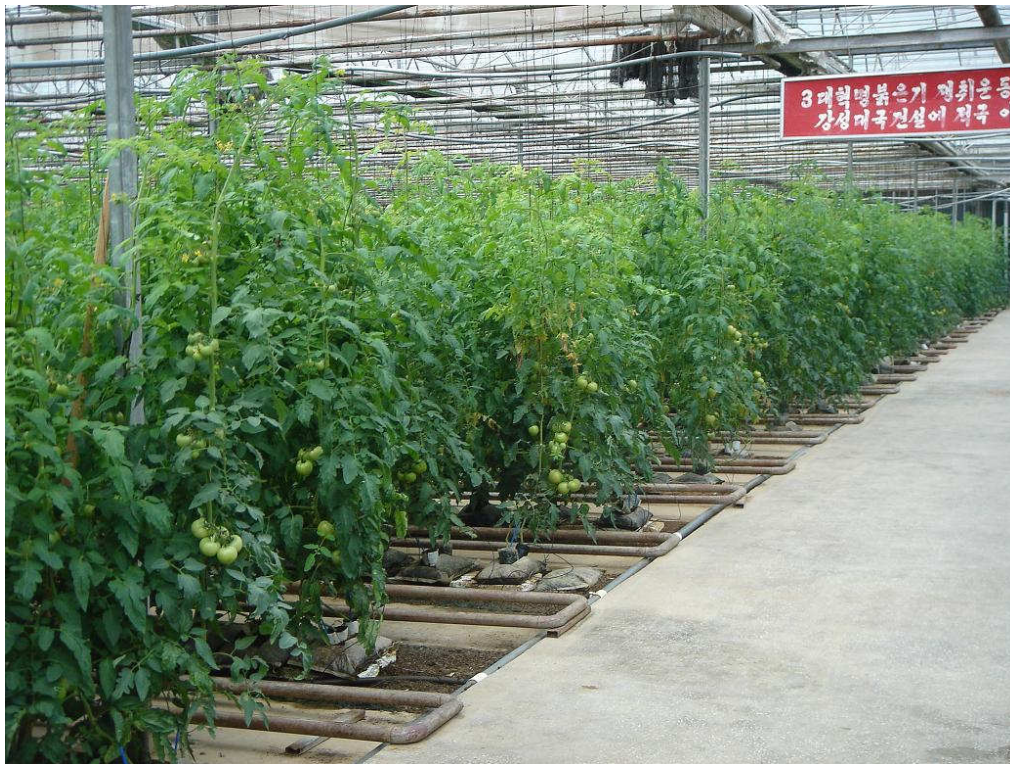
Photo: visiting a company in the field of agribusiness