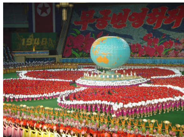
Photo: delegates of a previous mission attending the famous Arirang Massgame