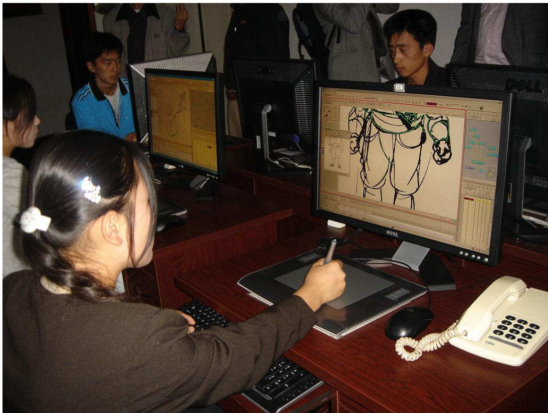
Photo: visits to companies in the field of animation (e.g. SEK) are possible