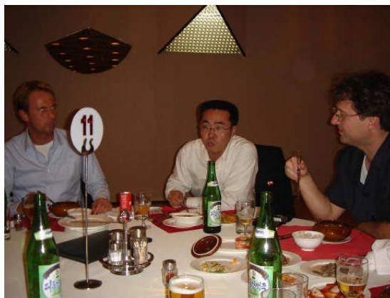
Photo: at a local restaurant - in excellent place for informal business discussions