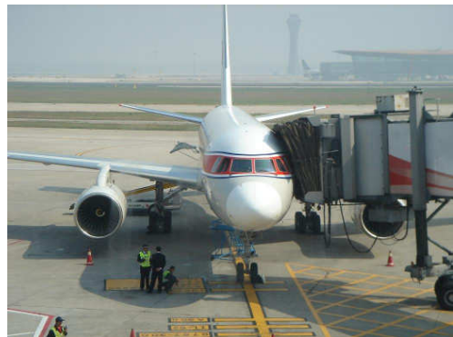
Photo: one of the new planes of Air Koryo

Schedules of business meetings will be handed out to the participants, after which a welcome dinner will take place.