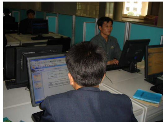
Optional: a visit to a university

There will also some time available for tourist activities, such as a citytour of Pyongyang, an art gallery and (if this takes place during our visit in September) the spectacular Arirang Massgame.