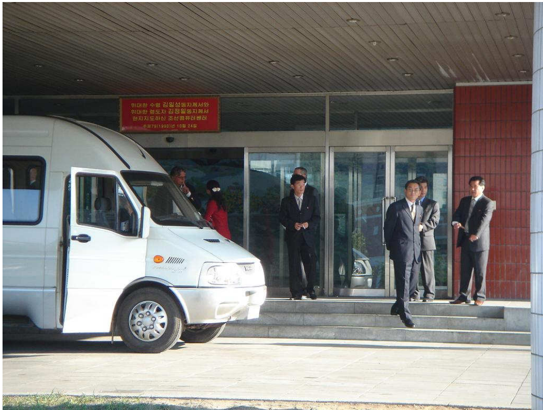
Photo: visits to companies in the field of Information Technology (e.g. KCC) are possible