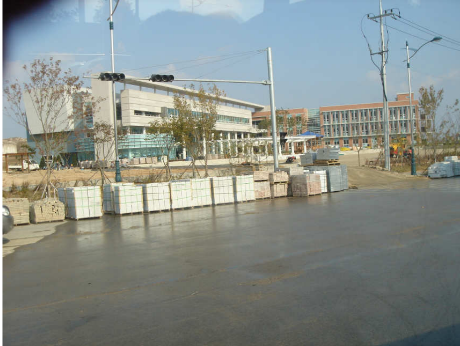
Photo (above and below): the rapidly expanding industrial zone at Kaesong

GPI Consultancy, P.O. Box 26151, 3002 ED Rotterdam, The Netherlands Tel.: +31-10-4254172, fax: +31-10-4254317 E-mail: info@gpic.nl , web: http://www.gpic.nl