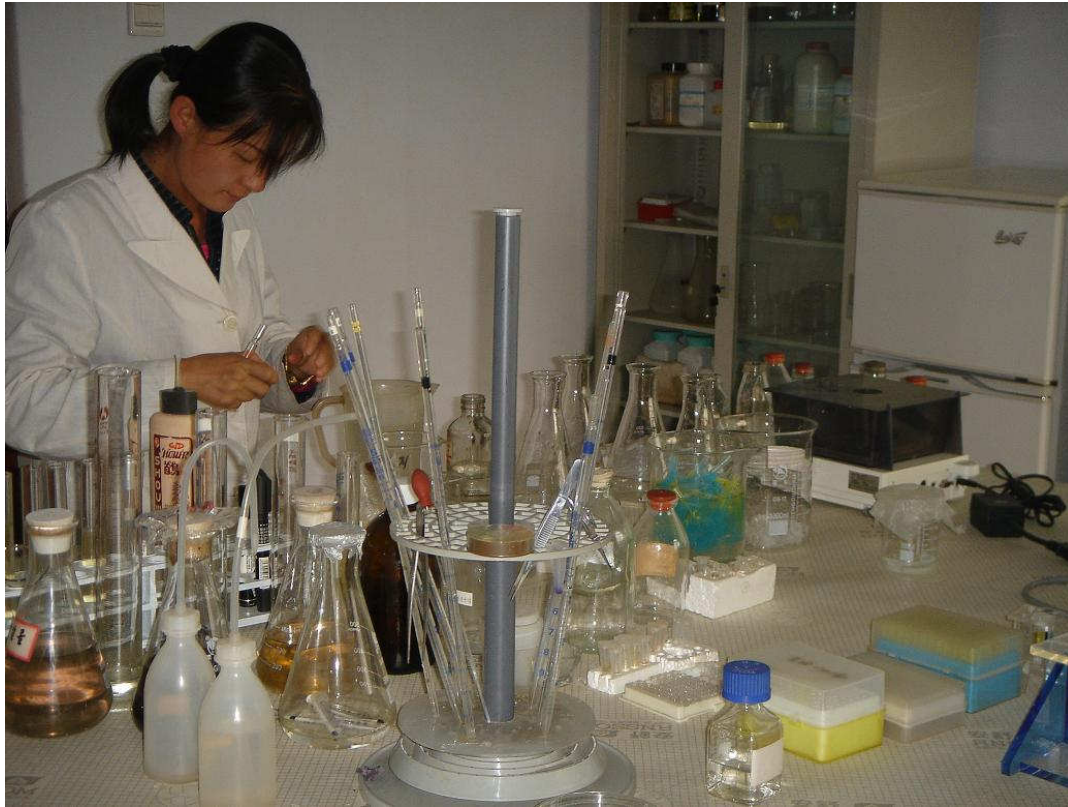
Photo: visit to a company in the field of agribusiness (research lab)