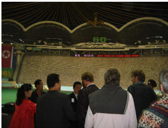
Photo: delegates attending the famous Arirang Massgame

There was also some time scheduled for tourist activities, such as a citytour of Pyongyang and attending the spectacular Arirang Massgame.