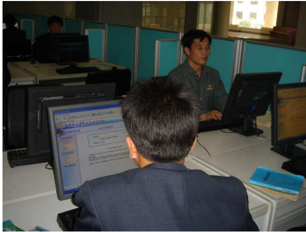
Photo: a visit to the electronic library of Kim Chaek University

There was also some time scheduled for tourist activities, such as a citytour of Pyongyang and attending the spectacular Arirang Massgame.