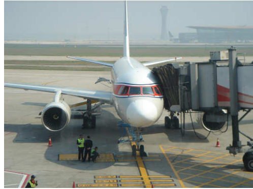
Photo: one of the new planes of Air Koryo

Upon arrival, our delegation was welcomed by representatives of the DPRK Chamber of Commerce in Pyongyang. Transport was arranged to the Yanggakdo Hotel, which appeared to be an excellent business hotel. Schedules of business meetings were handed out to the participants, after which a welcome dinner took place.