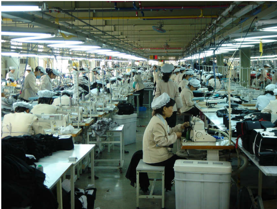
Photo: example of a company in the field of textiles