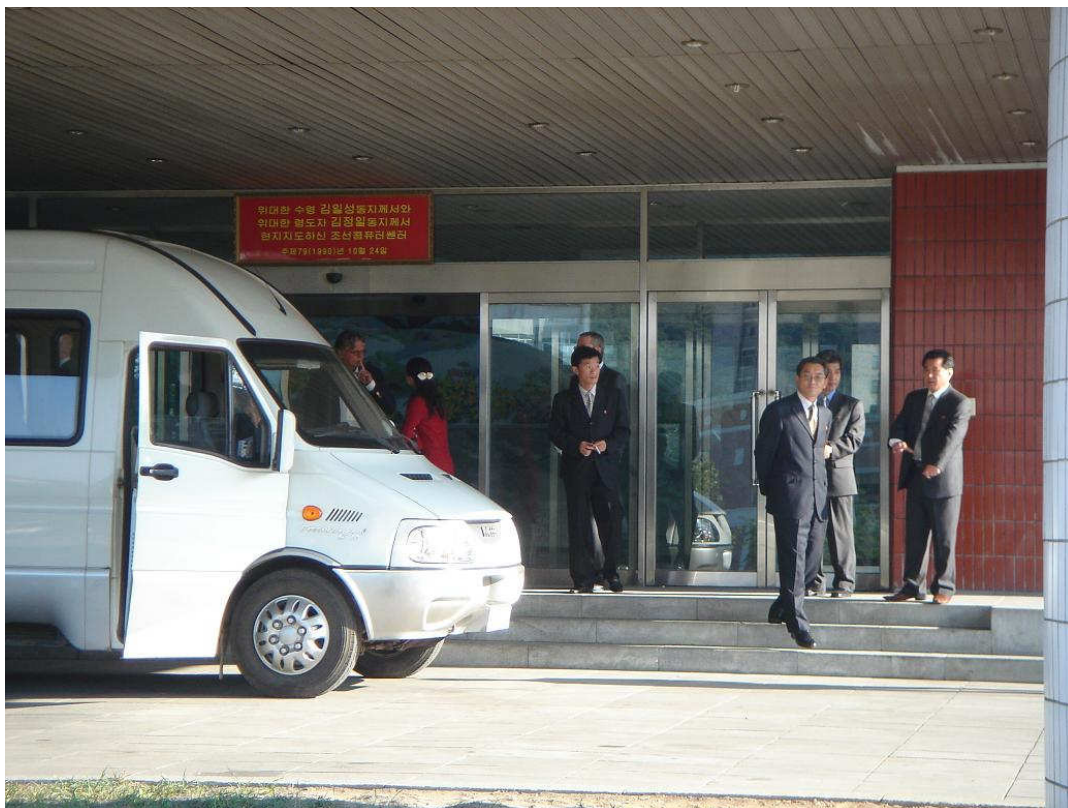
Photo: visit to a company in the field of Information Technology (Korea Computer Center)