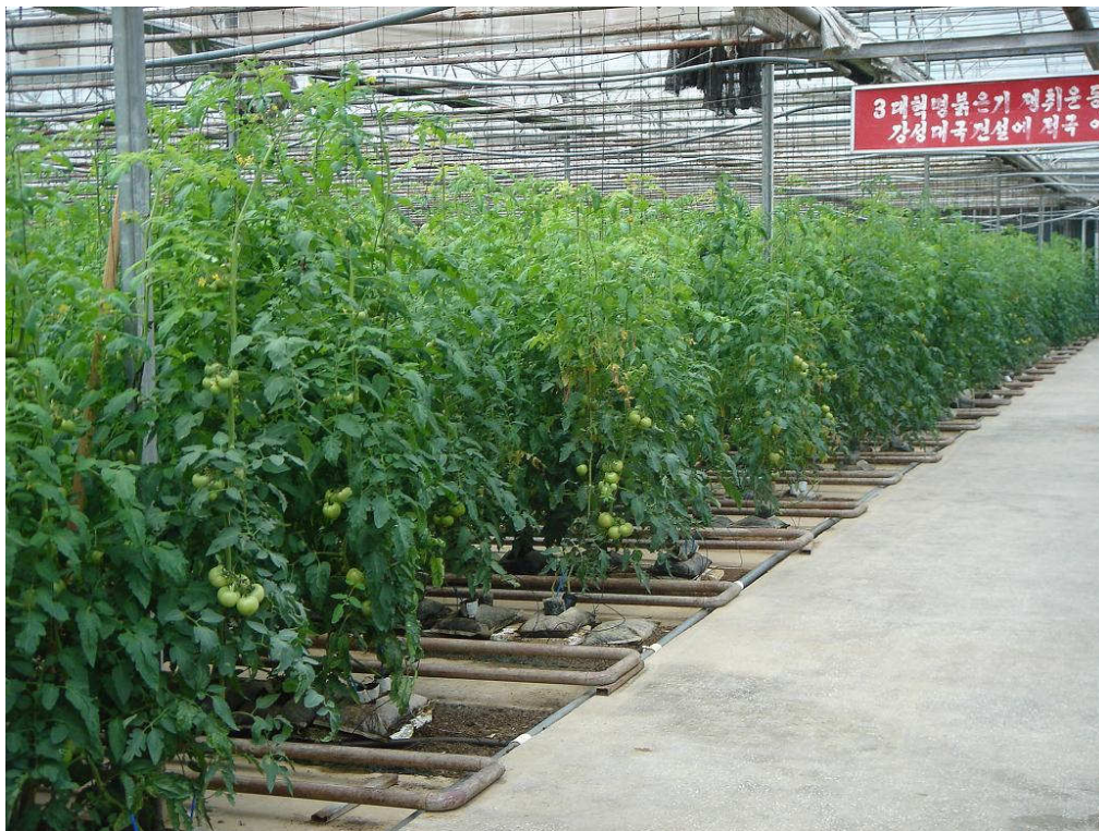
Photo: visit to a company in the field of agribusiness (greenhouse)