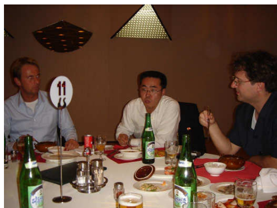
Photo: at a local restaurant - an excellent place for informal business discussions