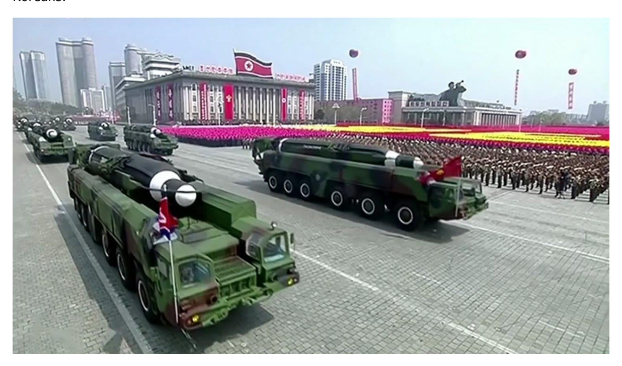
Sometimes, a military parade is being held on the 15^{th} of April, the 'Day of the Sun'. Picture is from 2017.

Are you interested in learning about these political and economic developments, and in having discussions with North Koreans? Then you are welcome to join our press tour in April 2018. We try to make program interesting and well-varied, and it will include various visits (e.g. to factories, a school, a farm, museums, a university) in Pyongyang, while attending some cultural events as well. We will also travel south to Kaesong and the DMZ (DeMilitarized Zone) at Panmunjom. During the tour, there will be options for formal and informal discussions with Koreans.