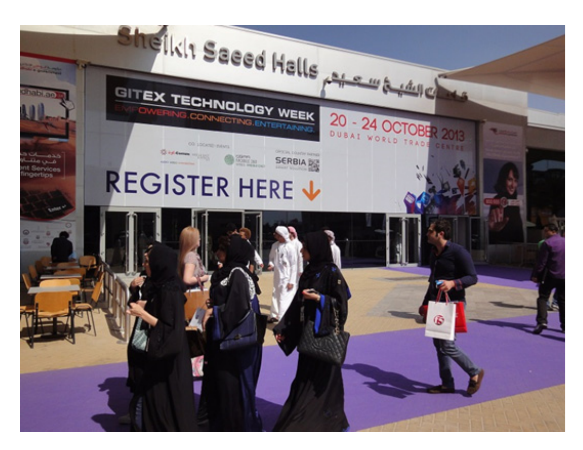
A number of Dutch companies exhibited at Gitex, including TomTom and Philips: