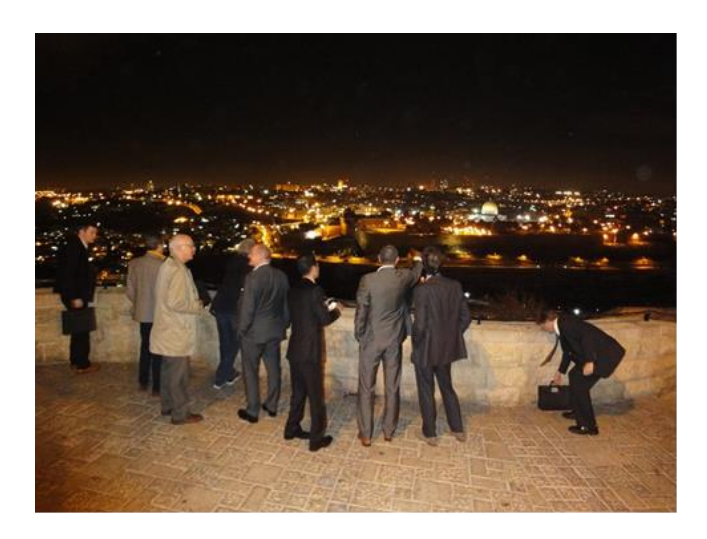
Impression of a previous mission to Palestine: informal meeting with members of PITA; an excursion to Jerusalem.