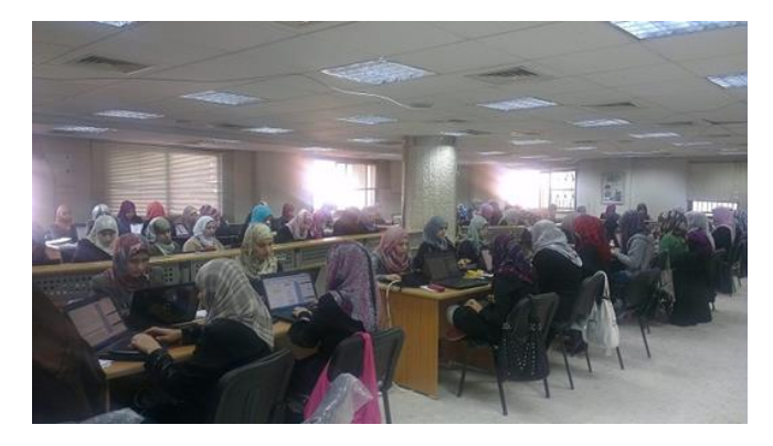
Software engineers and data processing staff at Unit One