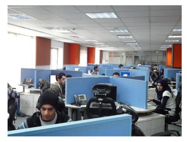
Visiting a software company in Ramallah