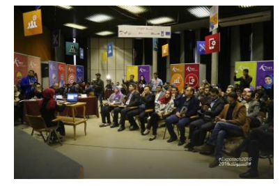
Impression of the ExpoTech in 2016