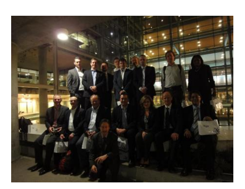
Participants of a previous mission

The interest for offshore sourcing is growing in Europe, and companies are currently investigating the advantages of international collaboration. Taking part in a business mission